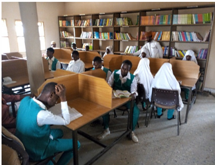
The College Library