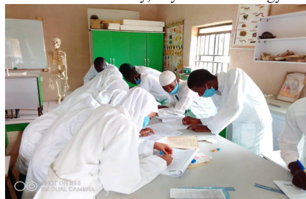
The Chemistry Laboratory