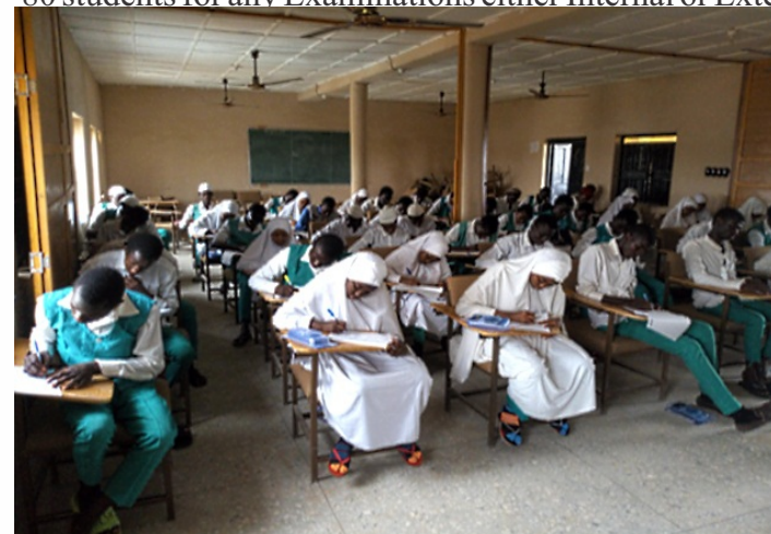
The Examination Hall

f. Examination Hall . It is Standard and can accommodate 80 students for any Examinations either Internal or External.