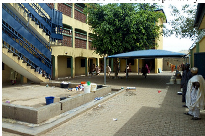
One of The Students Hostel Blocks