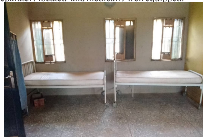
The College Sick Bay

e. Sickbay . The Sickbay for male and female students separately located and medically well equipped.