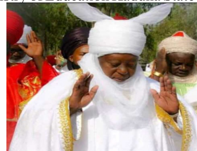
ALHAJI (DR) SHEHU IDRIS CFR LATE EMIR OF ZAZZAU

Appropriate consent and approval to operate the college was given by the Ministry of Education Kaduna State on 12th December, 2013.