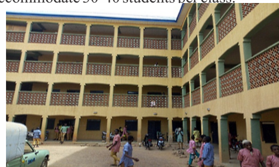
The Classrooms Block