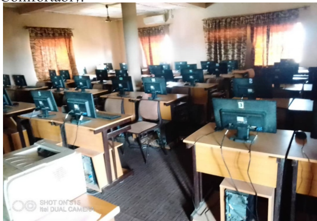
The Computer Laboratory